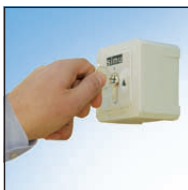
Key Switch With 240V Electric Motor