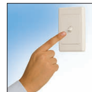
Wall Switch With 240V Electric Motor