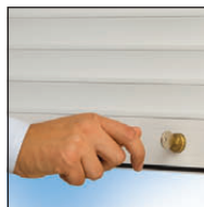
Spring Loaded With Key Lock