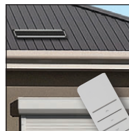
Remote Control With SolarSmart™ Plus Automation 12V Motor (Up To 50Kg)