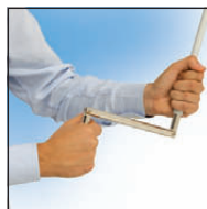
Crank Handle With 240V Electric Manual Override Motor