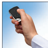
Remote Control (Key Ring Transmitter) With 240V Electric Motor & Multi-Function SIMU RSA Hz Radio Receiver & Control Unit