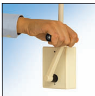
Steel Cable Winder (Up To 50Kg)