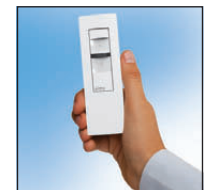
Remote Control With 240V Electric SIMU Hz Motor

* When used in conjunction with an assist spring as per CW Products specifications.