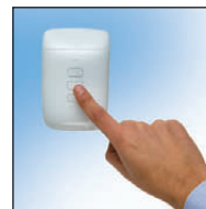
PowerSmart™ Control System With 12V Motor (Up To 50Kg)*